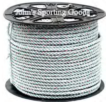
1/4" Leaded Rope Sale Price $38 600ft Leaded Rope Reg. Price $48